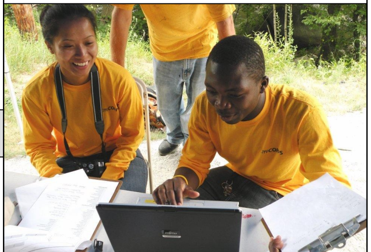
Youth from Spindle City Corps creating an interpretive trail map and guide for the Concord River Greenway.

This summer, SCC youth returned to West Meadow with pride to assess last year's projects, which yielded excellent results. It's only been a year since they did the bulk of their work at West Meadow, but already we have seen (Cont. on p.3)