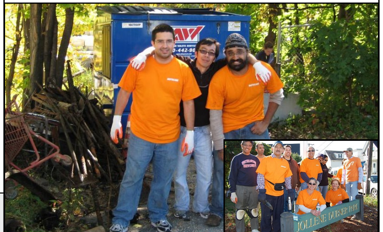
Motorola volunteers worked on several LP&CT projects, including River Meadow Brook clean-up (above) and Jollene Dubner Park.

LP&CT thanks the Lowell Solid Waste & Recycling Office for providing dumpsters for both corporate clean-up events.