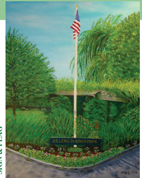
SIGN & FLAG

Ensuring the park is enjoyed by future generations