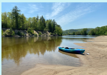
CARRIE DEEGAN, SPNHF

There are many inviting sandbars on the insides of meander bends; the first one you pass ( Riverland Conservation Area ) is a town beach accessible by car,